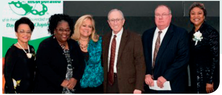
Dayton Chapter of The Links, Incorporated Celebrating 65 years of Service – September 2014