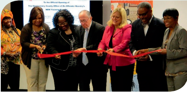
Reentry Training Center Ribbon cutting – September 2014

of service delivery and to accommodate the emergent operational needs of the MCOER. The increased training space and computer system upgrades provide dual training delivery and meeting space; a separate learning computer lab is designed to promote small group activity needs for personalized development and instruction.