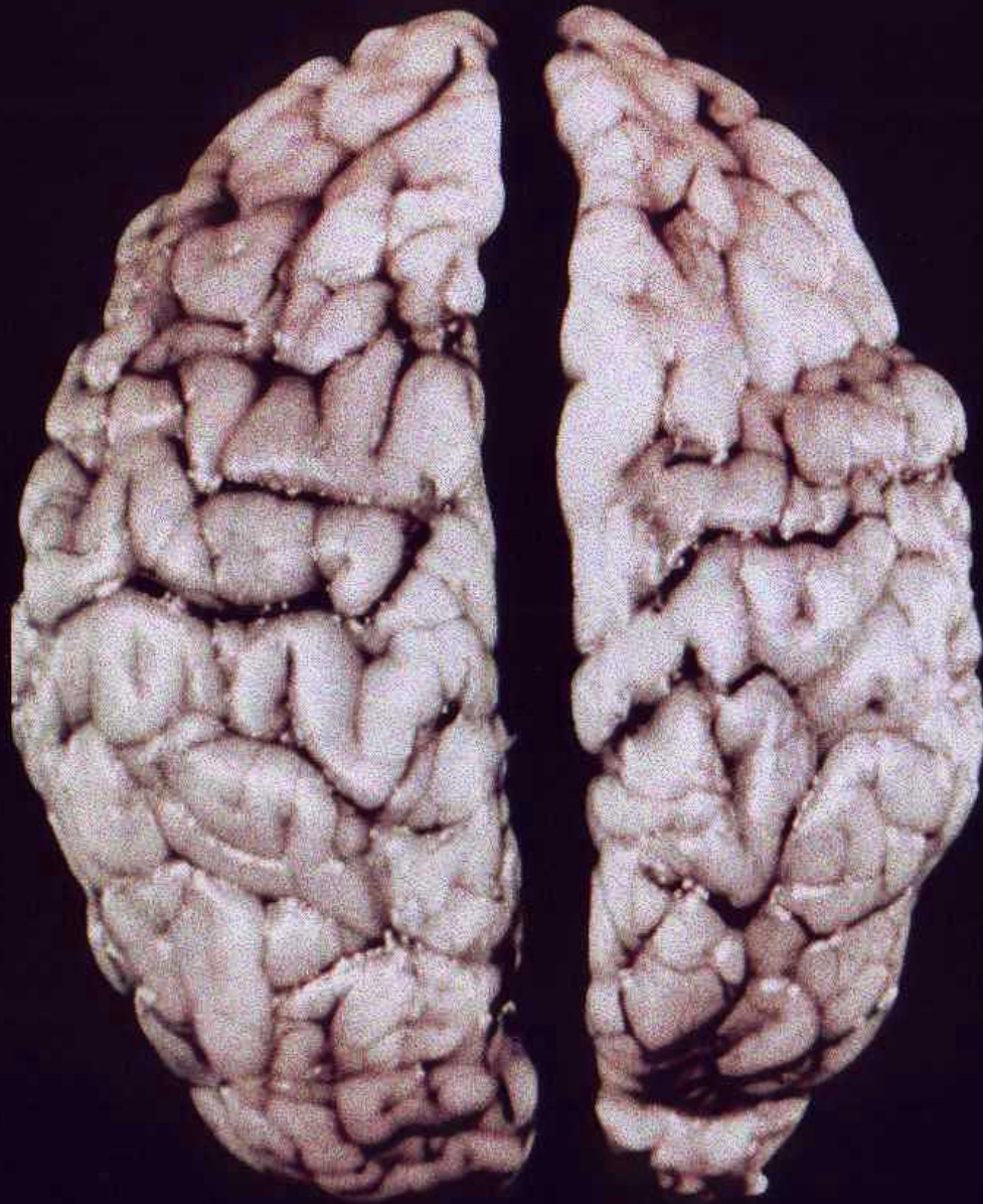
6-Week Old Baby "Normal" brain