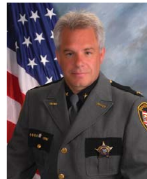
Sheriff Phil Plummer